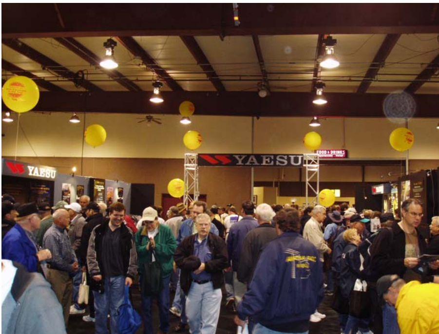
Time to pick up a new Yaesu Hat