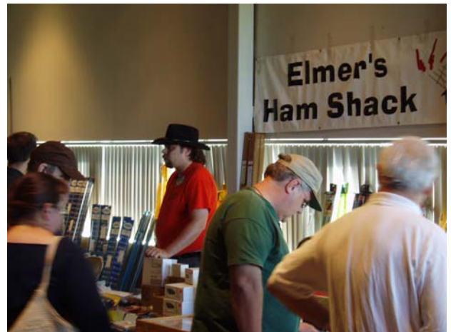
Elmer's Ham Shack from Gaylord provided lots of new ham toys to drool over.

A good time was had by all who attended.