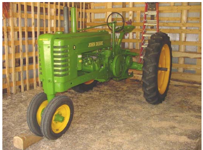
John Deere 1940 – Model B – Finished 9-04-06